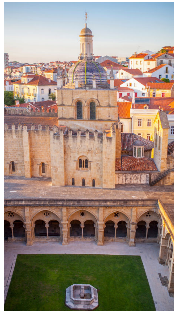
Monastery of Santa Cruz