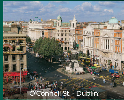
O'Connell St. - Dublin