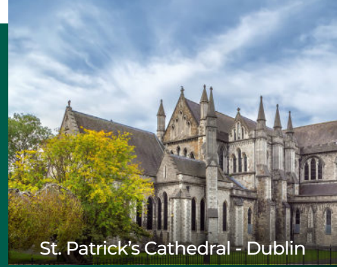
St. Patrick's Cathedral - Dublin

Website: nativitypilgrimage.com/fr-garcia