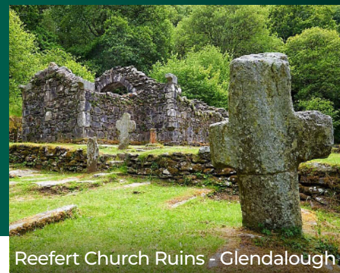
Reefert Church Ruins - Glendalough