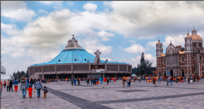
Basilica of Our Lady of Guadalupe