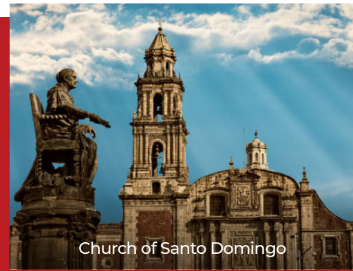
Church of Santo Domingo