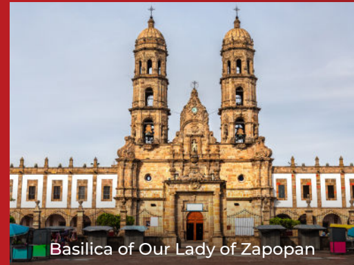
Basilica of Our Lady of Zapopan