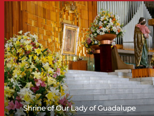
Shrine of Our Lady of Guadalupe