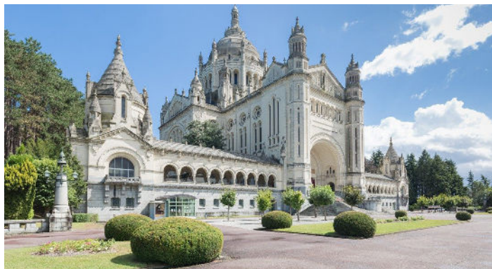
Basilica of St. Teresa Lisieux