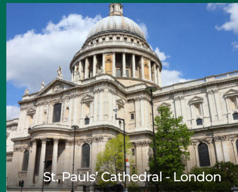
St. Paul's Cathedral - London

After enjoying a delightful breakfast, we'll set off together to London airport, where we'll catch our flight home.