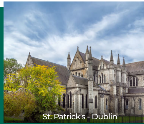
St. Patrick's - Dublin