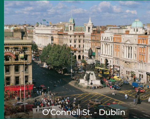
O'Connell St. - Dublin

fifteenth century. We'll conclude our day with dinner at your London hotel.