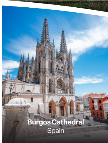
Burgos Cathedral Spain