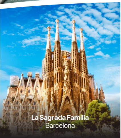
La Sagrada Familia Barcelona