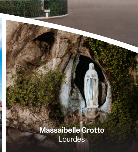
Massaielle Grotto Lourdes

of the most beloved Marian pilgrimage sites in the world. Upon arrival, check in at your hotel and enjoy dinner. In the evening, you may optionally participate in the Candlelight Procession, a deeply moving experience of prayer and devotion. Overnight in Lourdes.