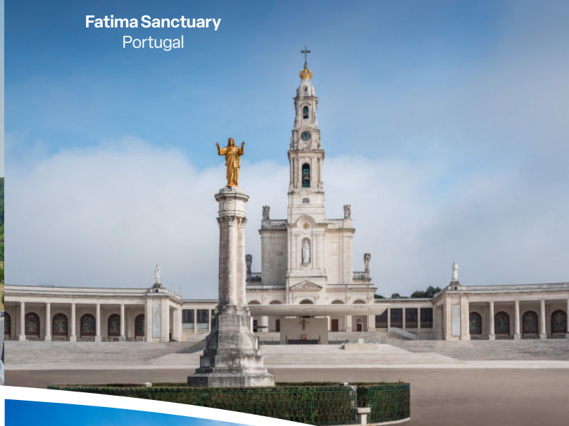
Fatima Sanctuary Portugal