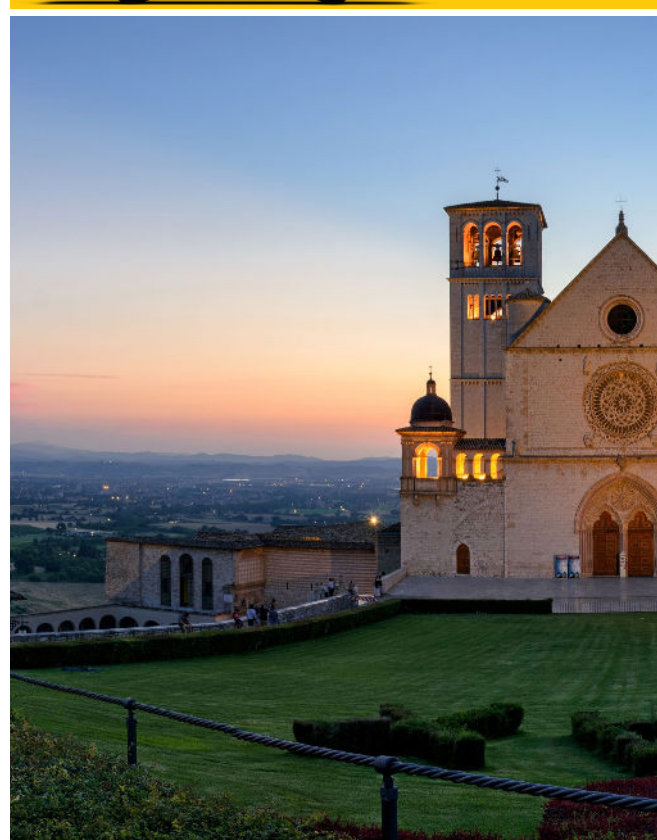
Basilica of St. Francis, Assisi