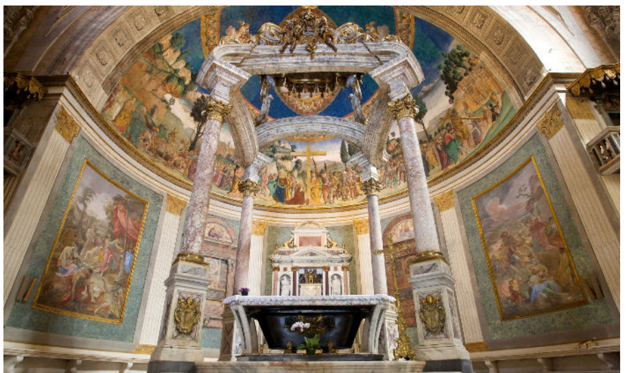
Santa Croce in Gerusalemme