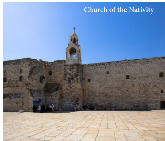
Church of the Nativity