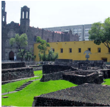
Plaza of the Three Cultures