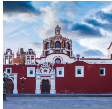
Church of Santo Domingo