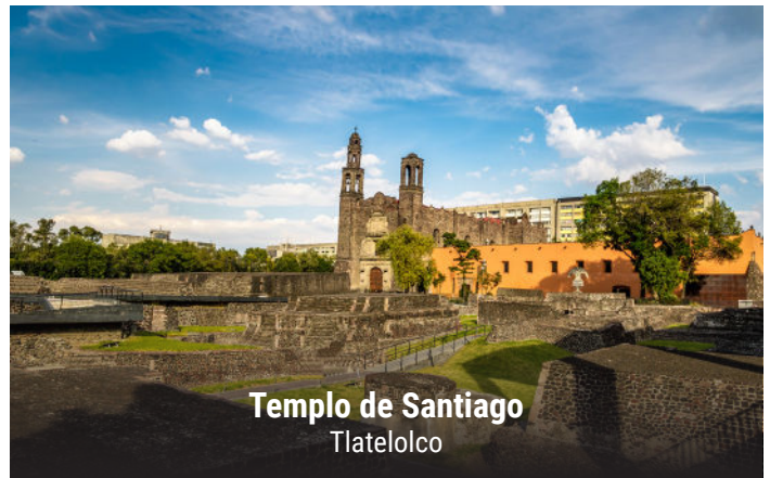
Templo de Santiago Tlatelolco