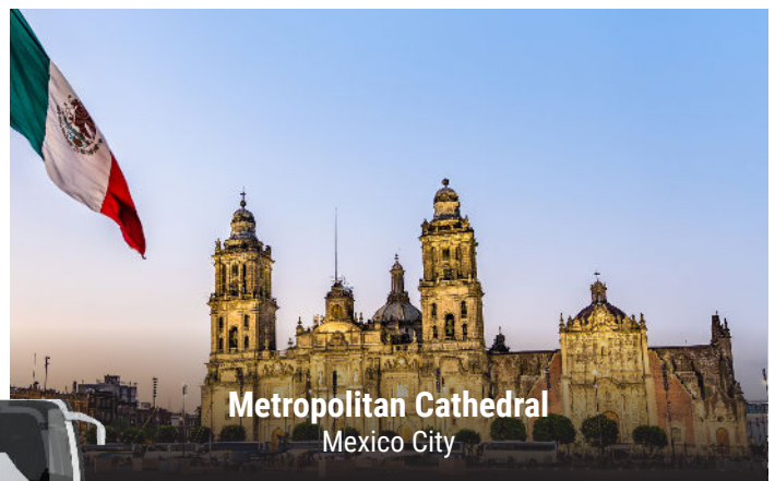
Metropolitan Cathedral Mexico City

Submit a non-refundable $300 deposit with your registration form & passport copy to Nativity Pilgrimage or use the QR code to register online. Names on passport and registration form must match exactly and passports must be valid for at least 6 months past your return date. Payment plans are available and full payment is due July 10, 2026.