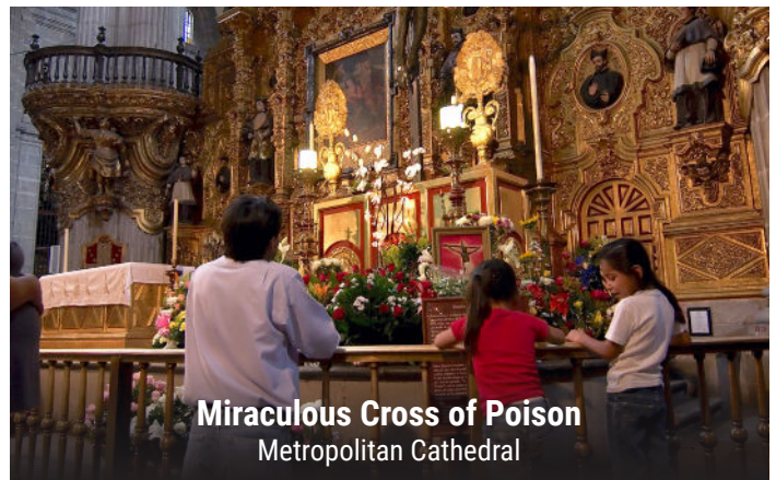
Miraculous Cross of Poison Metropolitan Cathedral