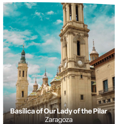
Basilica of Our Lady of the Pilar Zaragoza