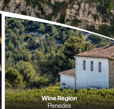
Wine Region Penedès