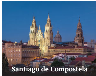
Santiago de Compostela