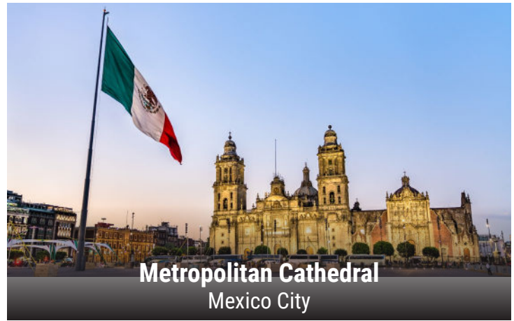
Metropolitan Cathedral Mexico City

Names on passport and registration form must match exactly and passports must be valid for at least 6 months past your return date. Payment plans are available and full payment is due 03/31/2026 . You can also register online via the website or scan the QR code.