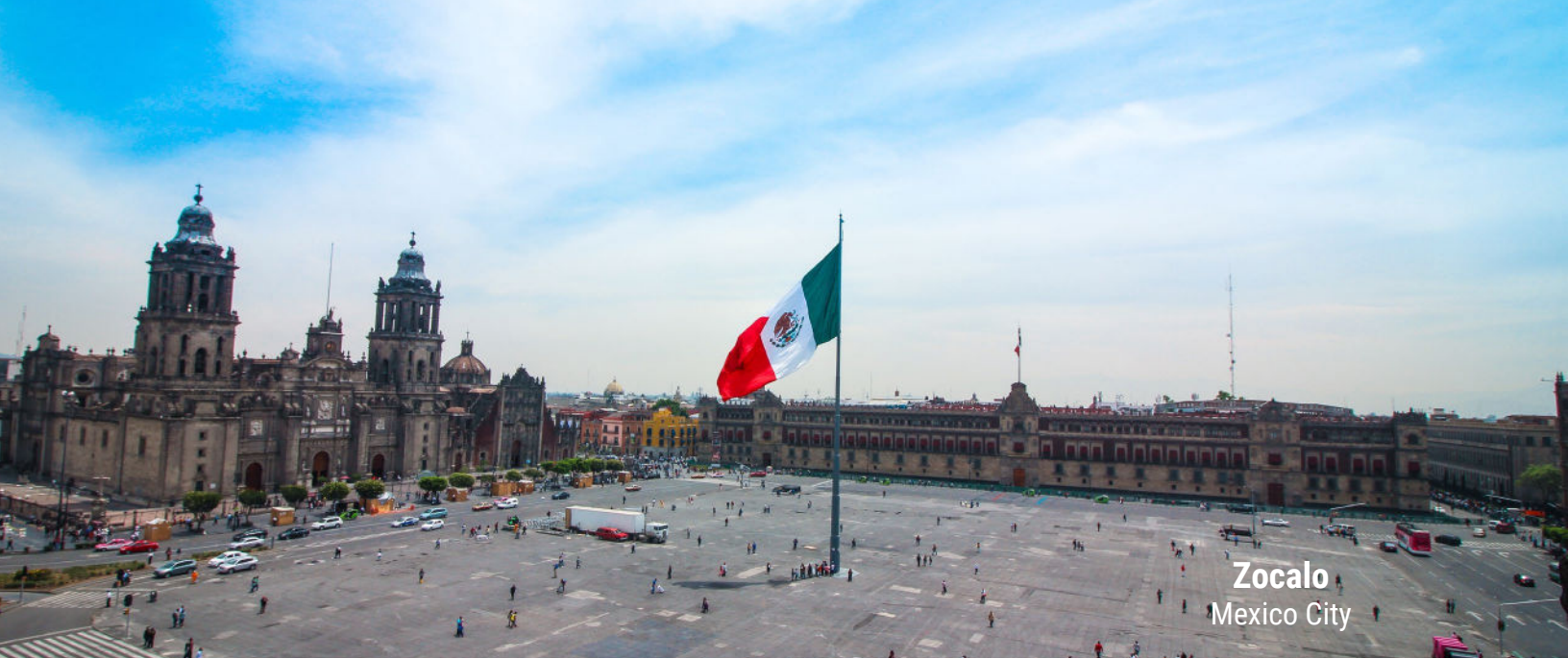
Zocalo Mexico City