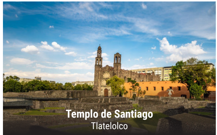
Templo de Santiago Tlatelolco