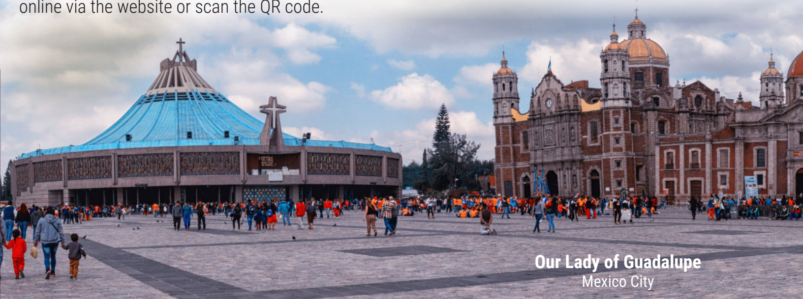
Our Lady of Guadalupe Mexico City