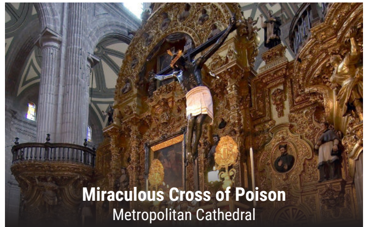
Miraculous Cross of Poison Metropolitan Cathedral