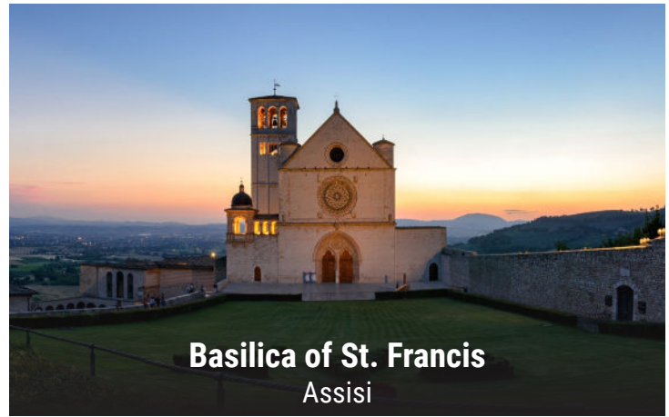
Basilica of St. Francis Assisi

This morning, we will transfer to the airport to catch our return flight home.