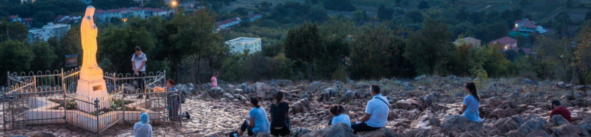
Apparition Hill, Medjugorje Bosnia and Herzegovina