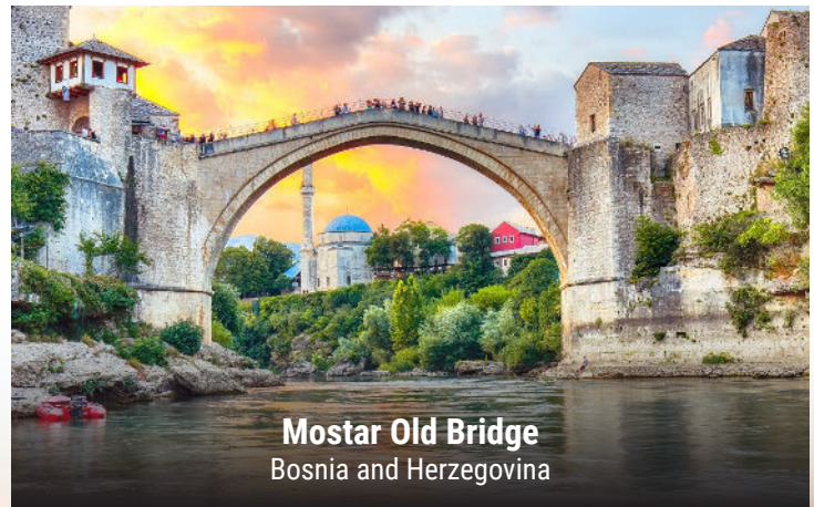
Mostar Old Bridge Bosnia and Herzegovina