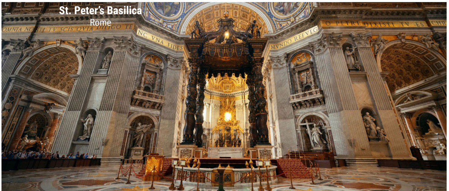
St. Peter's Basilica Rome