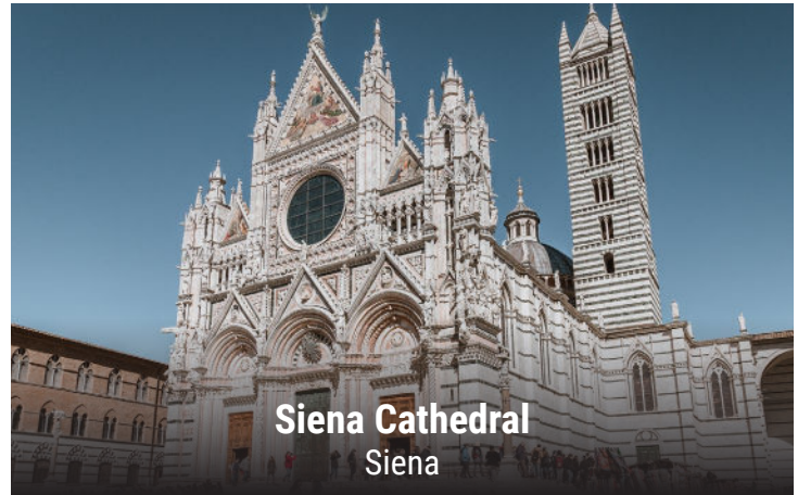
Siena Cathedral Siena