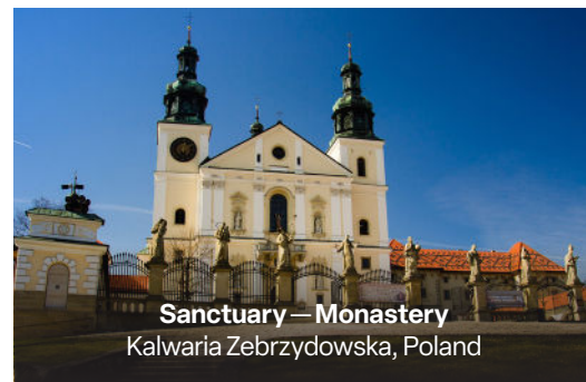
Sanctuary—Monastery Kalwaria Zebrzydowska, Poland