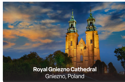
Royal Gniezno Cathedral Gniezno, Poland