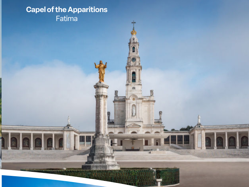
Capel of the Apparitions Fatima