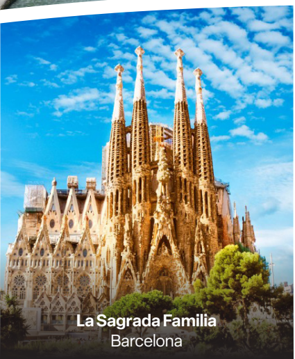
La Sagrada Familia Barcelona