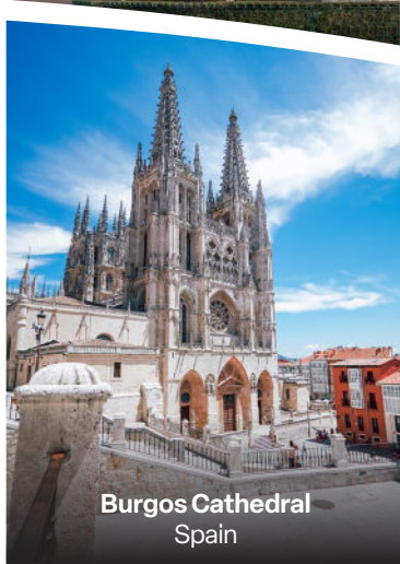
Burgos Cathedral Spain