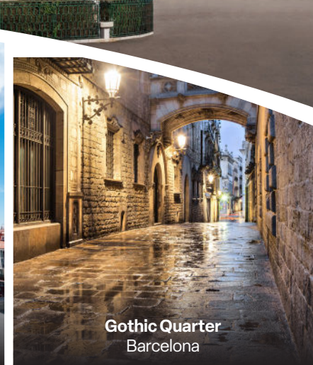
Gothic Quarter Barcelona