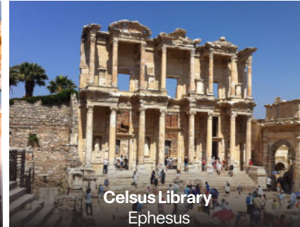
Celsus Library Ephesus

then explore the Grotto of the Apocalypse, where St. John wrote the “Book of Revelation.” You’ll also see the crack made by the divine voice of God. Enjoy dinner and an overnight stay on board the ship, surrounded by the stunning sea.