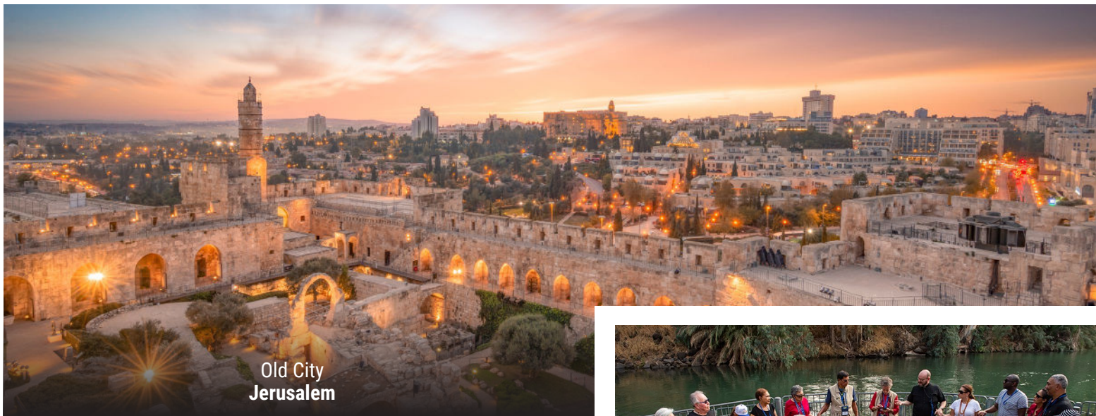
Old City Jerusalem

to renew our baptismal vows. We'll stop in Jericho, the world's oldest city, for today's Mass. Next, we'll visit the Mount of Temptation, where Jesus fasted, and Qumran, home of the Dead Sea Scrolls. Finally, we'll enjoy floating in the mineral-rich Dead Sea before returning to our hotel in Bethlehem for dinner and overnight accommodations.