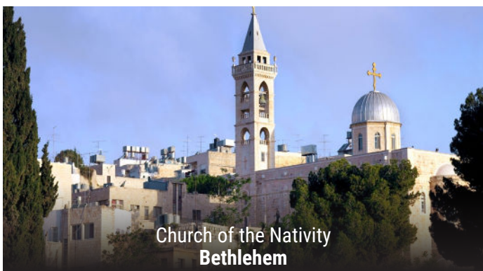
Church of the Nativity Bethlehem

register —Submit a non-refundable $300 deposit with your registration form and passport copy to the address below or use QR code to register online. The names on the registration form and passport must match exactly, and passports must be valid for at least 6 months from the return date. Full payment is due 07/13/2026.