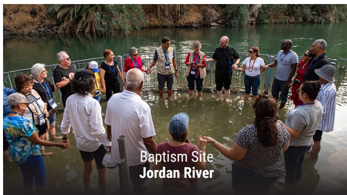
Baptism Site Jordan River

This morning, we'll transfer to the airport to catch our flight home, carrying with us the rich experiences and memories from our uplifting journey.