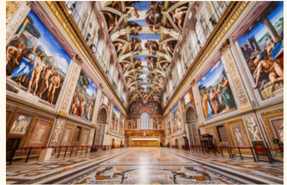
The Sistine Chapel