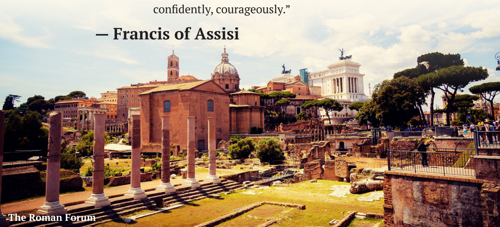
The Roman Forum