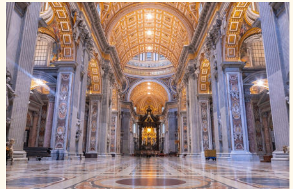
St. Peter's Basilica