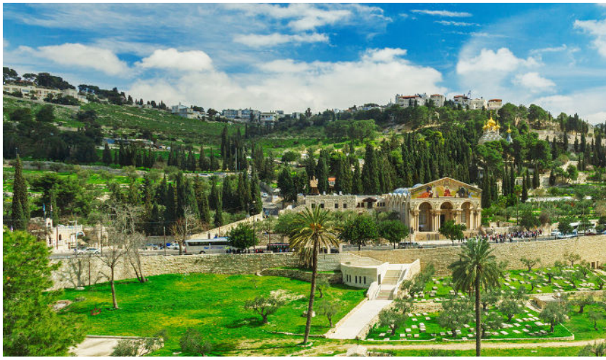
Mount of Olives Jerusalem

Jordan River before stopping in Jericho for Mass and admiring the Mount of Temptation. Then we'll head to Qumran, home of the Dead Sea Scrolls, with a chance to float in the Dead Sea. After a day of discovery, we'll return to Bethlehem for dinner and a peaceful overnight stay at our hotel.