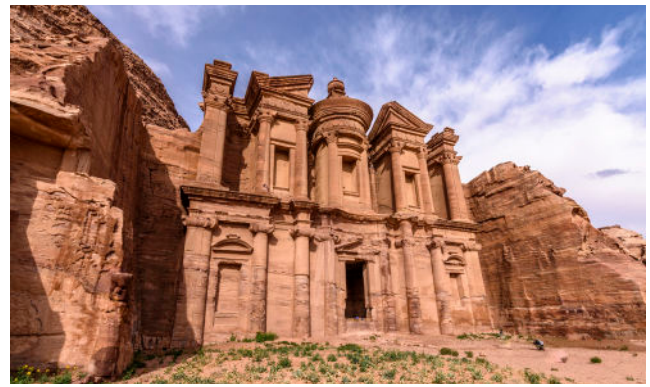
The Monastery Petra

As our journey ends, we'll head to the airport, our hearts filled with excitement and lifelong memories.