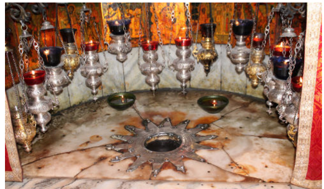
Church of the Nativity Bethlehem