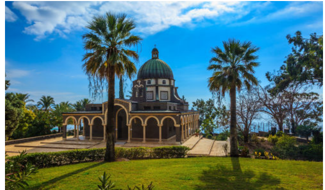
Mount of Beatitudes Sermon on the Mount