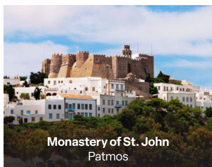
Monastery of St. John Patmos