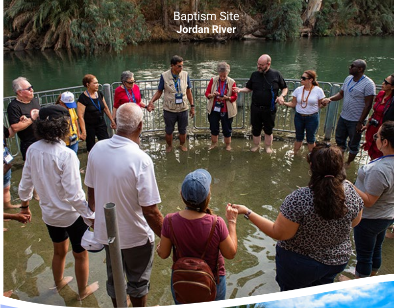
Baptism Site Jordan River