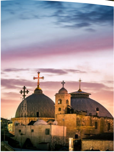
Church of the Holy Sepulchre Jerusalem