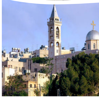
Church of the Nativity Bethlehem