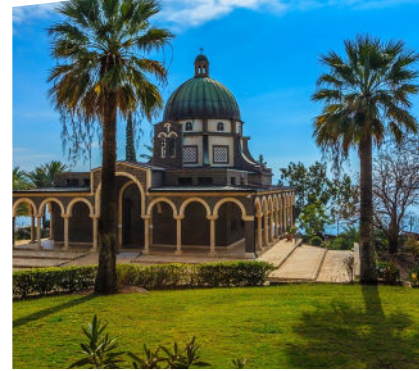
Mt. of Beatitudes Sermon on the Mount

recorded in the Gospels of Matthew, Mark, and Luke. Mass will be celebrated, and we will have time to 'listen to Jesus', as the disciples were instructed to do on this sacred mountain. We continue our scenic drive to Jerusalem, where our first stop will be St. Anne's Church, the birthplace of the Virgin Mary. After settling into our hotel, we will enjoy dinner and a restful overnight stay at our hotel in Jerusalem.