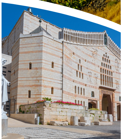
Basilica of the Annunciation Nazareth