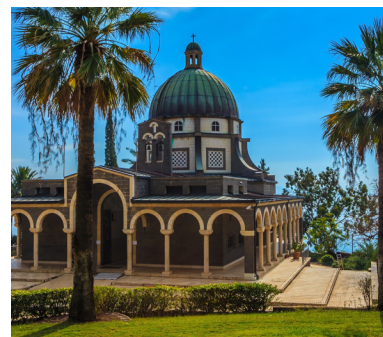
Mt. of Beatitudes Sermon on the Mount

vows at the site of Jesus' baptism. As we travel through the stunning Jordan Valley, we arrive in Jericho, the oldest city, and witness the Mount of Temptation where Jesus fasted. Our journey continues to Qumran, the site of the Dead Sea Scrolls discovery. Finally, we'll take a refreshing dip in the healing waters of the Dead Sea before returning to our hotel in Bethlehem for dinner and a restful night.