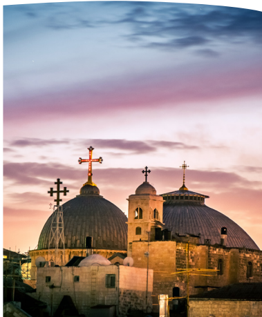
Church of the Holy Sepulchre Jerusalem