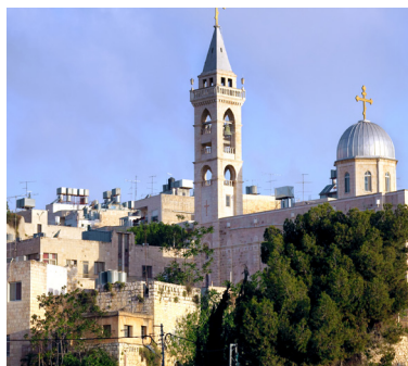
Church of the Nativity Bethlehem