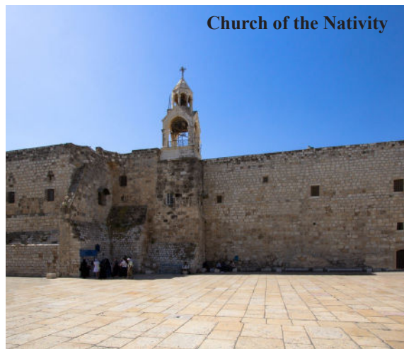
Church of the Nativity