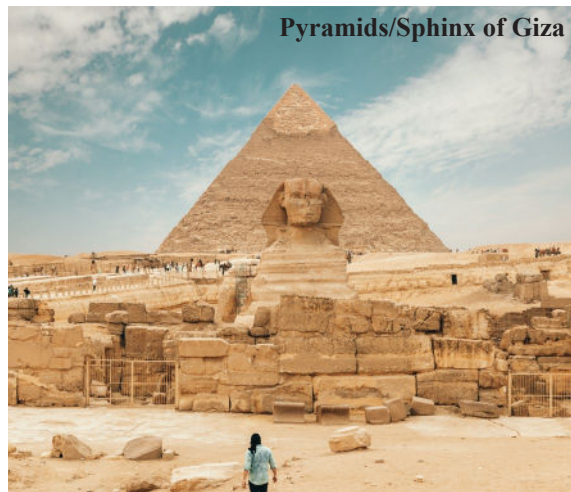
Pyramids/Sphinx of Giza