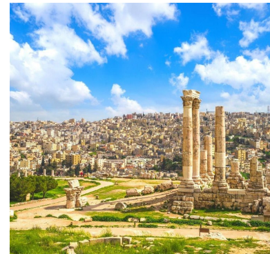
The Citadel Amman

The rest of the day is free for you to explore or relax, ending with dinner and an overnight stay in Bethlehem.