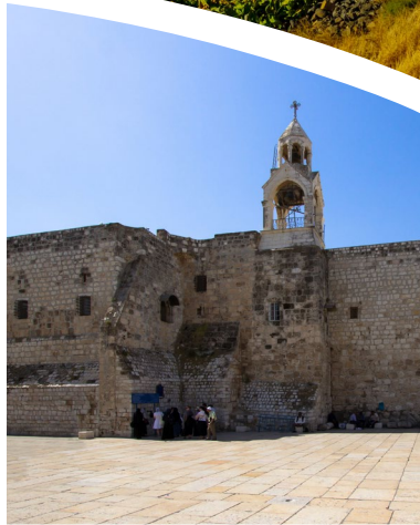
Church of the Nativity Bethlehem