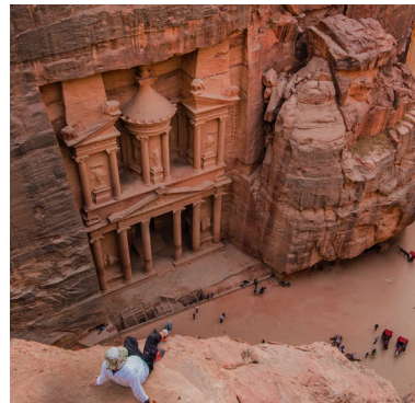
The Treasury Petra