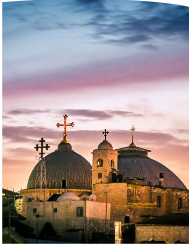
Church of the Holy Sepulchre Jerusalem