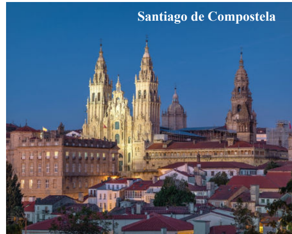
Santiago de Compostela