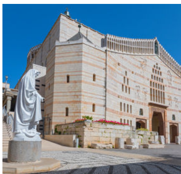
Basilica of the Annunciation Nazareth