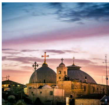
Church of the Holy Sepulchre Jerusalem