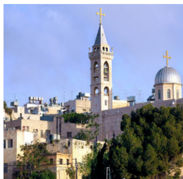
Church of the Nativity Bethlehem